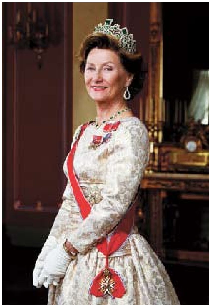
Queen Sonja of Norway